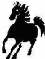
Dalneigh Primary School